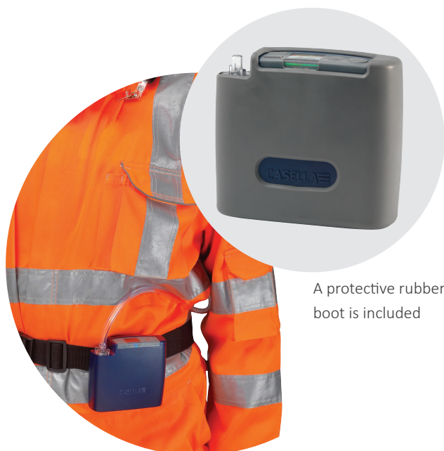
A protective rubber boot is included