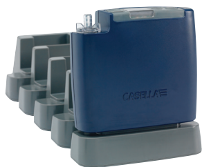
Apex2 pump with 5 way charger