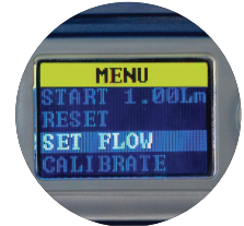
Easy to use menu