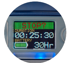
Colour coded display showing remaining battery life