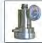
Demand flow regulator