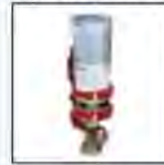
Cal gas wall mount