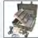
MicroDock II portable system kit